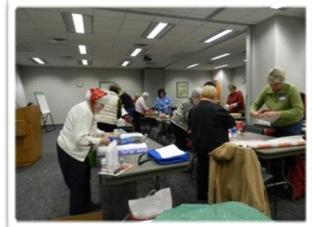
Santa's Quota elves busy wrapping up surprises for the 3 Christmas families the SDWC committee sponsored.